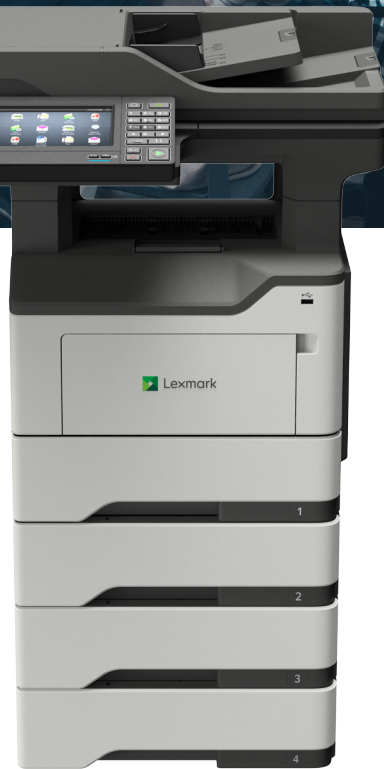
XM3250 with optional trays