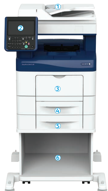
DocuPrint CM415 AP full configuration